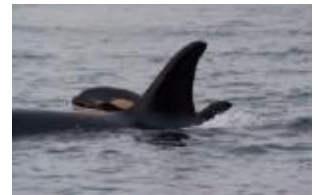
J39 with mom J11 .

Permission granted from the Orca Network..