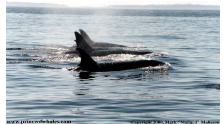
The J Pod.