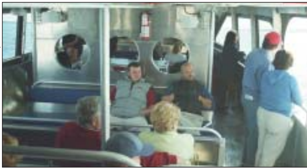
The interior of the main deck provides a sheltered seating and viewing area. The forward section is mostly enclosed and heated while the mid-section's sides are open to the ocean environment. Snap-on vinyl windows will cover the openings in less favourable weather.