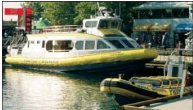
Prince of Whales Whale Watching's Ocean Magic tied up at the Greater Victoria Harbour Society's new Ships Point commercial pick-up/drop-off float with one of the company's 10 RHIB whale-watchers. Out "on the grounds" the whale-watching vessel skippers largely cooperate in the exchange of information on locations of the highly mobile, wide-ranging Orcas. Back in the harbour the whale-watching companies compete to put tourist "bums in the seats". The Ocean Magic has the passenger capacity of six whale-watching RHIBs plus a layout designed for extended, comfortable operation through the tourism shoulder and winter seasons. The vessel could also fulfil water taxi or freight carrier functions unrelated to marine ecotourism. ◀