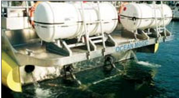
The Ocean Magic logged a 34-knot top speed during sea trials and a 25-knot cruise speed with 70 passengers on board. Propulsion is Twin Disc-Arneson ASD12 BILU SPP (surface-piercing propeller) drives with NiBrAl 35" x 37" five-bladed propellers supplied by Pacific Surface Drives, Richmond, BC. The drives provide full trim adjustment to passenger loading. The SPP props also have a very low under-water sound signature, an increasingly important consideration in the whale/marine mammal-watching industry. (The SPP propeller's low sound signature was first noticed when picked up on hydrophones in Johnstone Strait as the Arneson SPP drive-equipped RCMP patrol catamarans were passing at high speed.) Ocean Magic's main engines are 800 hp (@ 2300 rpm) Caterpillar 3406 E diesels with mechanically-actuated fuel injection and engine control/monitoring with the Caterpillar ECM (electronic control module). The Twin Disc MGX 5114 2:1 marine transmissions are combined with the new Twin Disc EC 300 electronic engine controls. They have an Express mode which achieves clutch control similar to a trolling valve. Automatic two-stage oil-pressure delivery allows the clutches to slip and propeller revolutions to drop to the 100 rpm range for slow-speed manoeuvring near whales and in dock approaches.